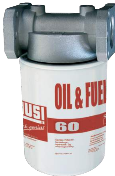
60 L/MIN FILTER