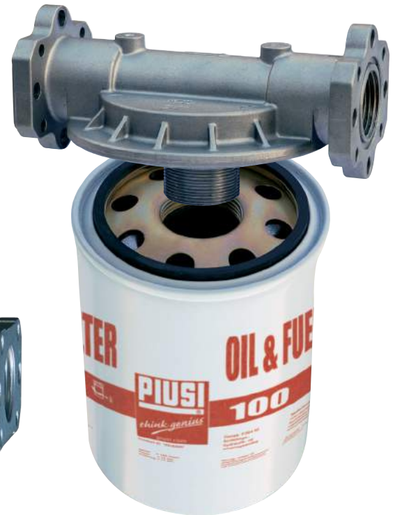
100 L/MIN FILTER